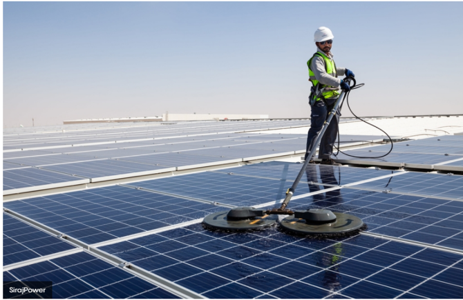
SirajPower extends solar ops, maintenance beyond its ME portfolio

Handling the operation, cleaning, and maintenance of solar systems will allow plant owners to focus on core businesses